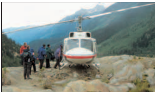
Start your hiking day with a helicopter ride.

Witness the snow-capped splendor of Mt. Robson, the highest mountain in the Canadian Rockies. At 3,954 metres (over 12,970 feet) above sea level, we are truly expanding our horizons. We wind down the day visiting the friendly, picturesque community of Jasper. Overnight at Jasper House Bungalows.