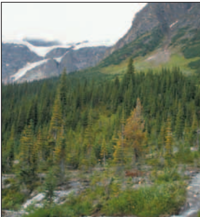
Snow-capped peaks of Rocky Mountains.

After breakfast we start off our day of adventure with a visit to Maligne Canyon. The Maligne Valley is riddled by the most extensive "karst" system in the world. A karst system is a geological formation of