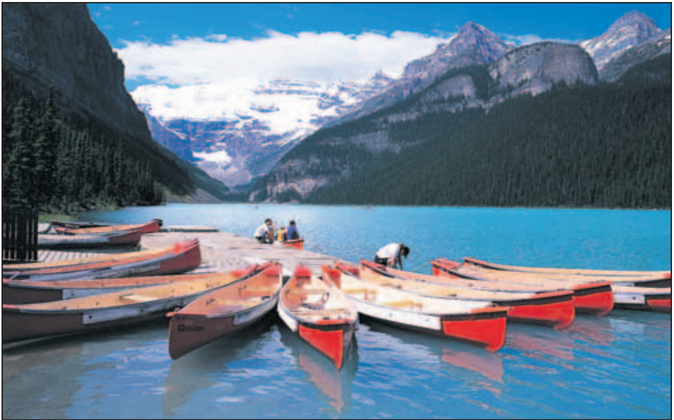
Turquoise-blue Lake Louise.

mountain hike. Expert guides show us the way, pointing out unique flora and fauna as we explore the Rockies from high above. Avid hikers will have the opportunity for an additional optional heli-hiking excursion later in the trip.