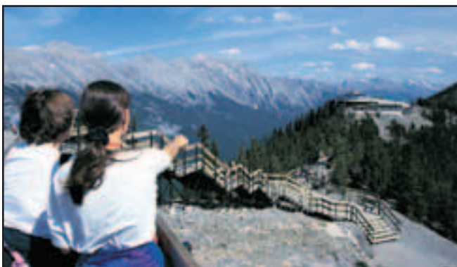
Sulphur Mountain Gondola in Banff.

Out of Bow Lake the mountains rise steep and rugged. The blue ice of Crowfoot Glacier hangs suspended over the turquoise water. To the west, the craggy peaks of the Great Divide tower over Bow Glacier. It's now a short trip to our first view of the imposing Victoria Glacier nestled behind beautiful