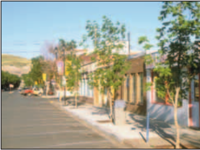
Drumheller — downtown area.

intriguing area was once the domain of the dinosaur. Today, we will see ancient treasures yielded by the earth at the Royal Tyrrell Museum of Paleontology. Some of the most stunning reconstructed dinosaur skeletons on earth stalk the exhibit space. There are ten signature galleries and feature exhibitions that celebrate the spectacular history and diversity of life on Earth. Visitors can join in a dinosaur dig or watch the experts release skeletons from their tombs of stone. At the end of our visit to Drumheller, it's back to Rafter Six for dinner and another restful night.