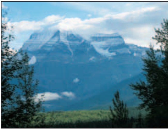
Jasper National Park.

Then we are set down in a mountain meadow where our guide will take us on a 3 to 3 1/2 hour tour during which they will interpret all that is seen including flora, fauna, and geology. After our heli-hike we continue our journey along the Icefields Parkway. Look for bighorn sheep and goats as we view the picturesque glaciers and valleys along the remainder of the Parkway to Jasper. This is a mountain retreat with all the modern amenities of a city surrounded by breathtaking scenery and an abundance of wildlife.