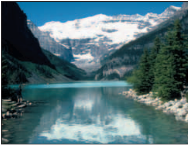
Lake Louise with Victoria Glacier in the background.