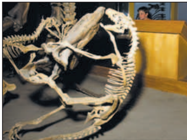
Royal Tyrrell Museum of Paleontology.

of the dinosaurs. We are now in the Drumheller Badlands, one of the few areas in the world where sedimentary layers from earlier time periods have been scraped off by natural processes, exposing a rich cache of fossils and even complete dinosaur skeletons. The exposed rock of Alberta's Badlands creates a mysterious moon-like landscape that reveals more than 70 million years of geological history. Gouged out of the prairie by ancient rivers and ice, this