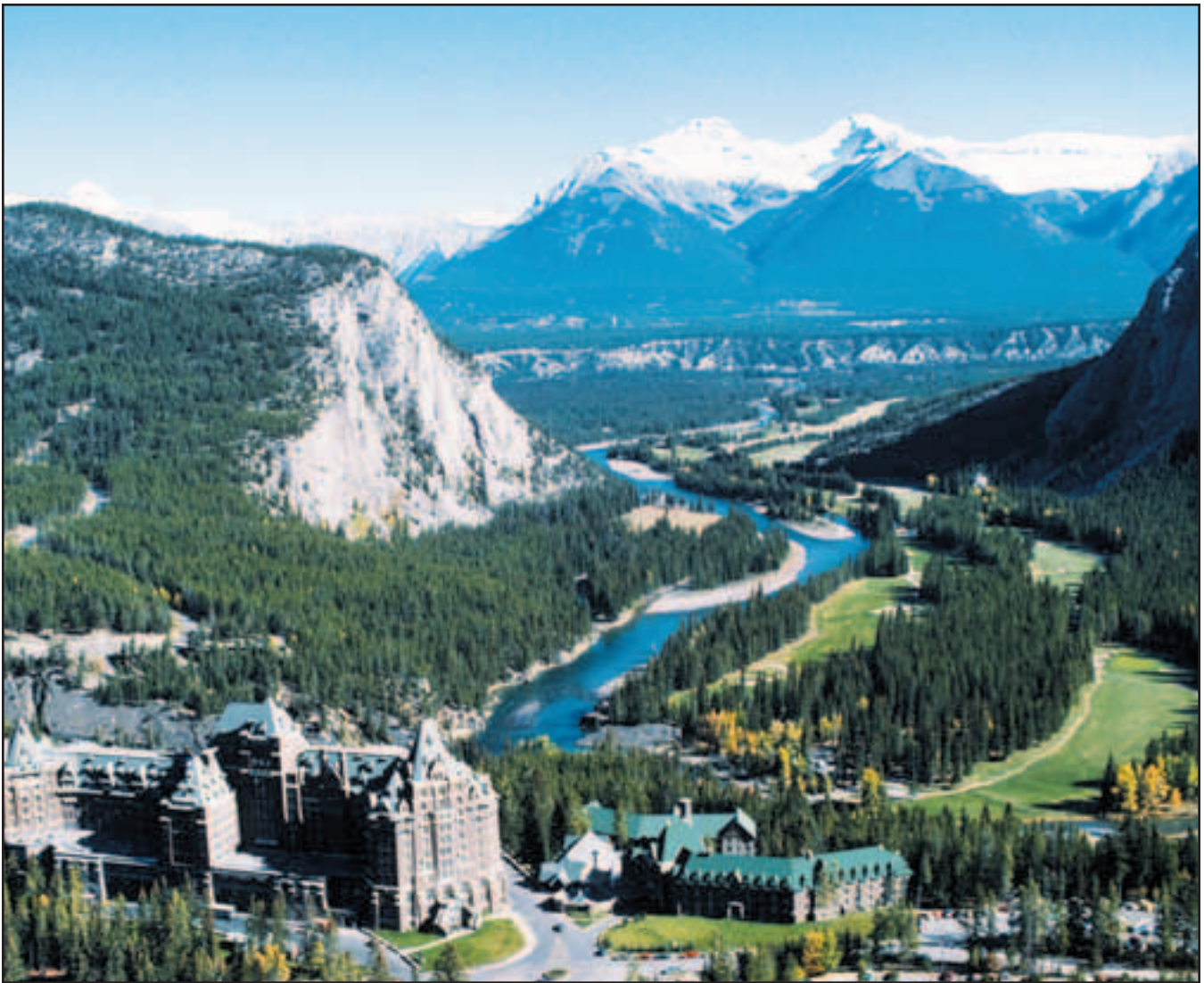
Fabulous scenery in Banff surrounding area.

spectacular alpine scenery. We can luxuriate in the comfort of soothing hot springs, where travelers have come to “take the waters” for more than a century. Average temperature is 39°C (103°F) year-round. Take the time to relax in the hot pool, enjoy the scenery, or visit the gift shop!