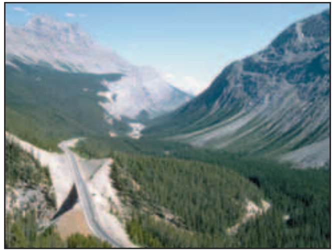
Columbia Icefields Parkway.