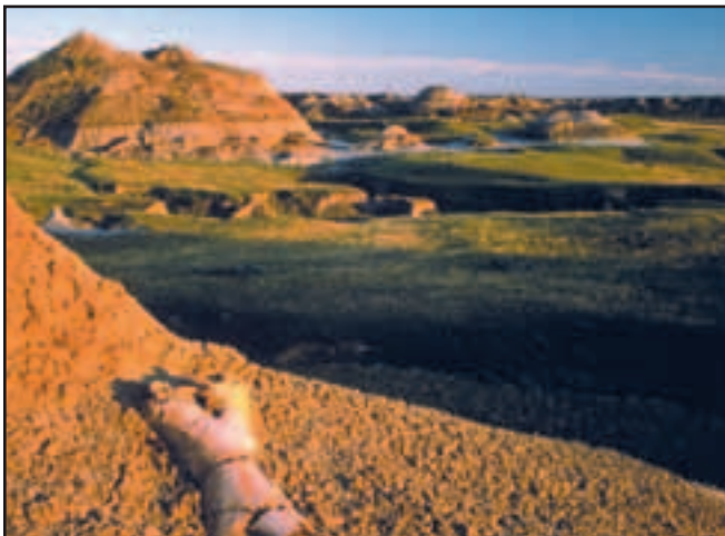
Badlands — once the domain of dinosaurs.

After a wholesome western breakfast, we head out across rich, rolling farmlands that suddenly break away to reveal an astonishing, twisting, turning canyon, walled with multi-colored layers of sandstone, mudstone and coal alternating with shale sequences. The rock layers date back to the late Cretaceous Period, just before the demise