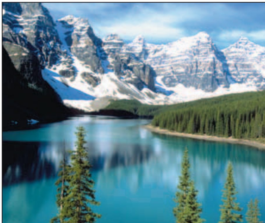
Relax and absorb the beauty of Banff National Park.

Journey into the heart of Canada's Rocky Mountains and witness the pristine beauty of snow-capped mountains, the stillness of crystal blue lakes, and marvel at the depth of the gorges and canyons — this is Canada's unspoiled wonderland!