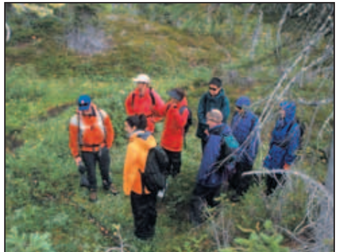
Our experienced guides will introduce you to Alberta's flora and fauna.

Then we are set down in a mountain meadow where our guide will take us on a 3 to 3 1/2 hour tour during which they will interpret all that is seen including flora, fauna, and geology. After our heli-hike we continue our journey along the Icefields Parkway. Look for bighorn sheep and goats as we view the picturesque glaciers and valleys along the remainder of the Parkway to Jasper. This is a mountain retreat with all the modern amenities of a city surrounded by breathtaking scenery and an abundance of wildlife.